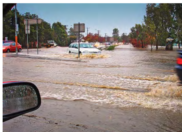
The Maitland and Bell Street intersection during the 2007 June long weekend floods.

In future years the income will be used to fund a variety of additional activities associated with the management