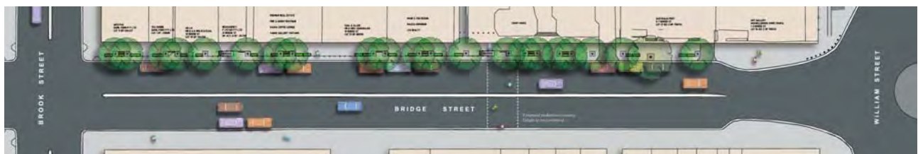
Conceptual drawing of the proposed Bridge Street improvements.

This project forms part of the CBD Strategic Plan, a joint production of the Muswellbrook Chamber of Commerce and Industry and Muswellbrook Shire Council aimed at revitalising Muswellbrook's town centre.