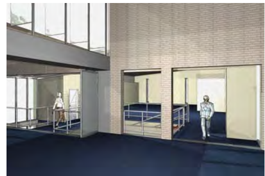
Conceptual drawings of Muswellbrook Library extension

This project has been made possible through the Federal Government Economic Stimulus funding of $2.17m and funding of $200,000 from the State Libraries NSW Library Development Grant. Remaining funds will be a direct contribution from Muswellbrook Shire Council.