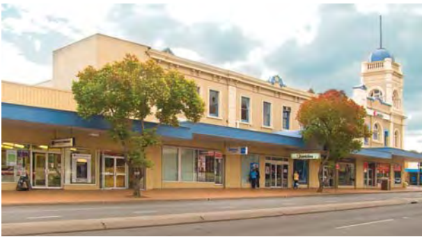
Campbell's Corner as it stands today.

Originally built in 1870, the site and its history are an integral part of Muswellbrook's sense of identity. Its tower and dramatic architecture make an impressive avatar for Muswellbrook as a whole.