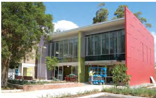
The new rear extension featuring two seminar rooms downstairs, and upstairs a students study area, local history room, periodicals reading lounge and balcony.

A variety of programs and events will take place in the new library for guests of all ages. See the back page of this newsletter for details on the new First Thursday Book Club, Anime Manga Club and children's storytime sessions.