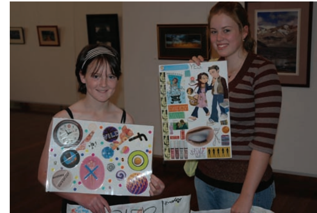
The Collins sisters at the collage workshop "Cut em up Stick em Down" showing off their artworks

"Cut em up & Glue em down" – the collage workshop began with a brief history and overview of collage. The participants were then