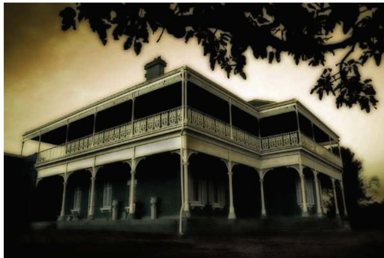
Kelly Munce, Skellatar House 2005, digital print, Muswellbrook Shire Collection

The Local Artists Heritage Exhibition engages with Muswellbrook's Heritage not only through presenting the viewer with images from the past but also by implementing a variety of artistic strategies to refer to the theme, engaging multiple approaches and formats to spark dialogue.