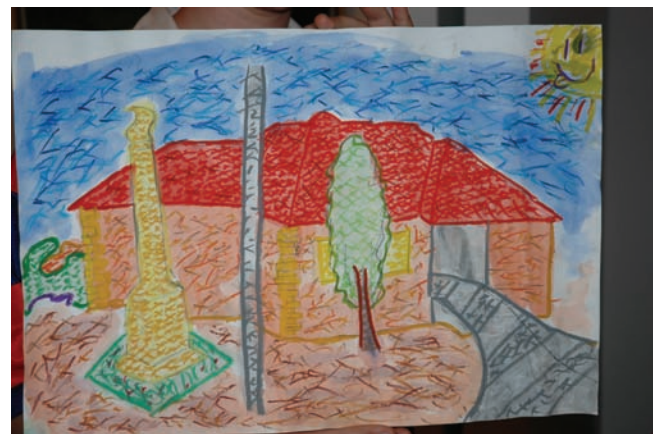
Martin Curnow's painting of the QE11 building

got to take home a DVD with all 3 movies. 'Paint the Town' - Watercolour and Oil Pastels involved a quick lesson on perspective then the participants sat on the steps of the Muswellbrook Regional Arts Centre to sketch the QE11 Square and Community Centre. People then went inside to reproduce their sketches and add watercolour. They then applied oil pastels to highlight their water colours.