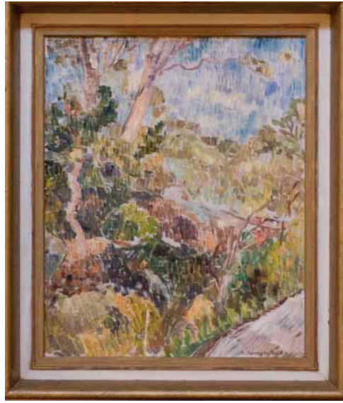
Grace Cossington Smith, Design in Bush oil on canvasboard, 1953.