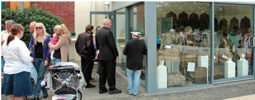
The Anzac Day Exhibition in the Community Room