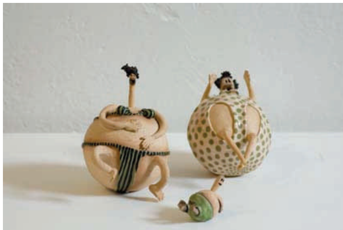
Betty Gleeson The Three Bathers undated terracotta Muswellbrook Shire Art Collection