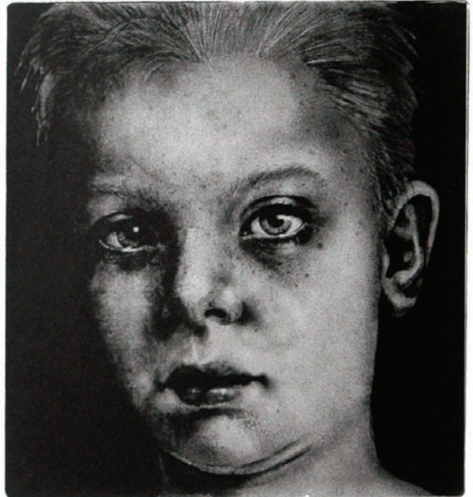
Cherry Hood Untitled No. 7 2002 etching