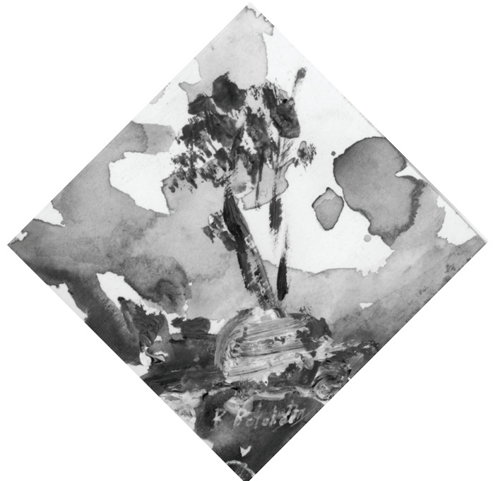
David Dolahenty Still Life With Flowers No. 7 2005 watercolour (Miniatures XI)

Miniatures XI will open at 6pm on Friday 31 March in conjunction with Utopia - A Picture Story and a selection of works on paper from the Max Watters Collection. All of these exhibitions will be on display until Sunday 21 May.