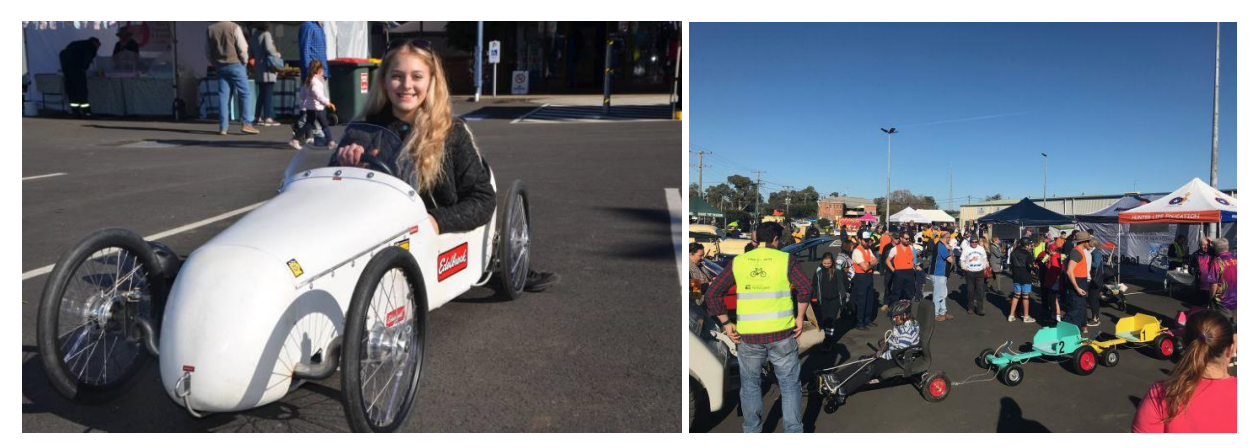
Including You – Pilot Program with Ability Links

The inaugural Mt Arthur Coal Soapbox Derby took place on 23 June 2018. Council supported this fundraising event which was organised by and for the benefit of Hunter Life Education. This event was well attended and aimed to foster connections between families and community, drive business to the area and bring a fun event into the town centre.