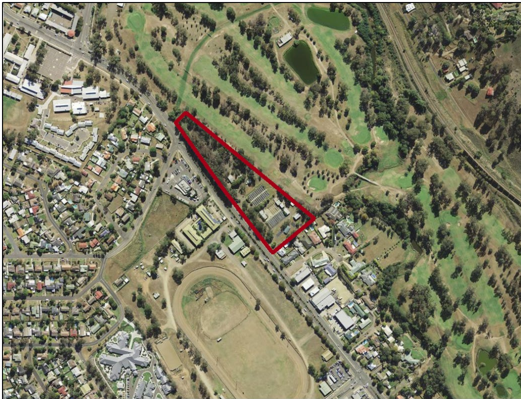
Figure 1: Location of the Subject Land identified as Lot 100, DP 1261496, 72-74 Maitland Street, Muswellbrook