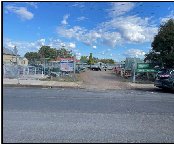
Figure 2 Ogilvie St

As mentioned, – the land is currently vacant of buildings. The land has however continued to be used in conjunction with the Rural Business owned by the proponents on the opposite side of the road as shown below.