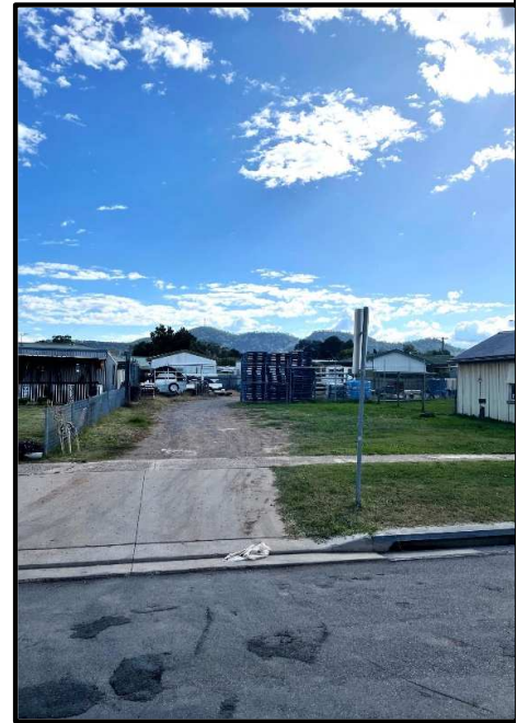
Figure 3 Paxton St