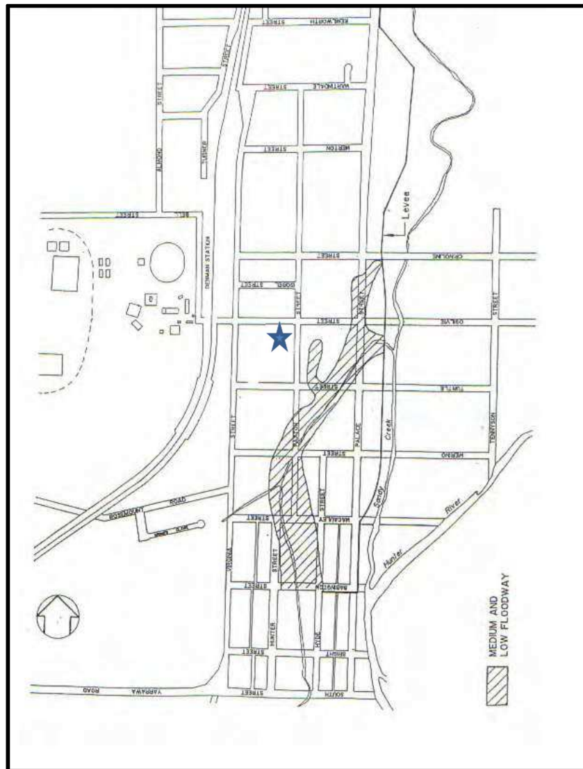
Figure 4 Extract from Muswellbrook DCP - Sec 13 - Flood Prone Land

The subject land is not subject to flooding as indicated in figure 7 below.