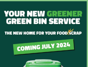
FOGO – a food and garden organics collection service – commencing mid-2024.

The Muswellbrook Animal Care and Sustainability Hub was opened by Member for Upper Hunter Dave Layzell. Council endorsed the development of a tailored model for the region to collectively grow and promote the visitor economy. Denman Memorial Hall rolled out the red carpet and upped the glamour for the awards night and celebration of the 10th anniversary of the Blue Heeler Film Festival.