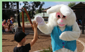
Easter Bunny made his annual appearance at the Family Fun Day at Olympic Park.