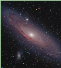
"Race to Space" with the summer reading challenge at the library.

In anticipation of the holiday season, the library launched "Race Across Space" as part of its Summer Reading Challenge, in collaboration with the shire's aquatic centres. Until 22 January 2024, junior library members, up to 12 years, are encouraged to get reading, log their books and earn free passes to local pools. As another busy and productive year at Council drew to a close the annual Christmas trees were installed, and the town festooned with festive decorations.