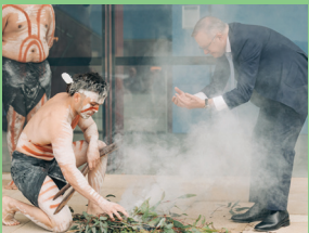
The Prime Minister participating in the Smoking Ceremony

Several water breaks saw extensive works under Council's policy to replace aging infrastructure get underway. Applications to Resources for Regions, Round 7 for road works in Hill Street Muswellbrook, and Round 9, for the rehabilitation of road and upgrade to stormwater and drainage in Merton St Denman, were successful. A record number of entries were received for the Mullins Conceptual Photography Prize a national $25,000 acquisitive prize that seeks to find Australia's best conceptual photographic works. June Council endorsed the concept plan for CBD Stage 7 streetscape improvements in Bridge St, along with construction of a "Pocket Park". CBD Stage 7 is a staged project which includes the demolition of unused buildings. As part of the public space network in the town centre, which includes Simpson Park and riparian areas along Muscle Creek and the Hunter River, it will offer a landscaped setting along the route between the larger open spaces.