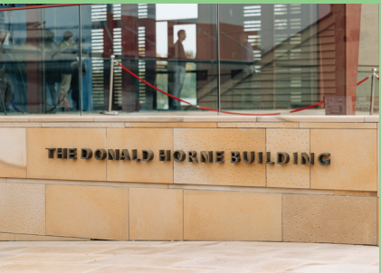
The Donald Horne Building, part of the Hunter Innovation Precinct, has created a lot of interest in the town centre.

Seven years in the making and the cornerstone of the Hunter Innovation Precinct, the Donald Horne Building was open by the Prime Minister of Australia the Hon. Anthony Albanese on 18 July. The extraordinary building houses an industrial prototyping facility and STEM Innovation Lab – a purpose-built space that provides students with the tools and mentorship to develop STEM skills.