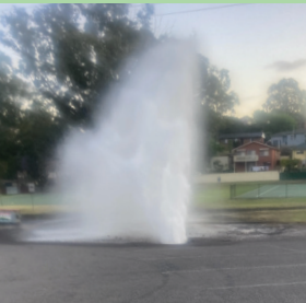
Water main breaks kept works crews busy.

Several water breaks saw extensive works under Council's policy to replace aging infrastructure get underway. Applications to Resources for Regions, Round 7 for road works in Hill Street Muswellbrook, and Round 9, for the rehabilitation of road and upgrade to stormwater and drainage in Merton St Denman, were successful. A record number of entries were received for the Mullins Conceptual Photography Prize a national $25,000 acquisitive prize that seeks to find Australia's best conceptual photographic works. June Council endorsed the concept plan for CBD Stage 7 streetscape improvements in Bridge St, along with construction of a "Pocket Park". CBD Stage 7 is a staged project which includes the demolition of unused buildings. As part of the public space network in the town centre, which includes Simpson Park and riparian areas along Muscle Creek and the Hunter River, it will offer a landscaped setting along the route between the larger open spaces.