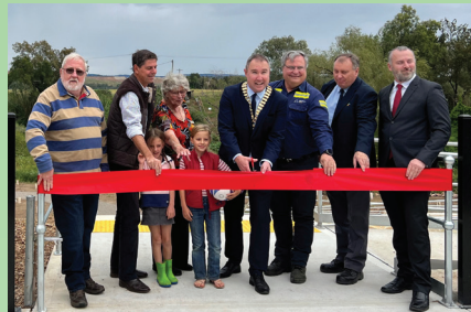
Tarinpa (Hunter Beach) was officially opened in front of an enthusiastic crowd.

Council endorsed the Draft 23-24 Operational Plan and 23-24 Budget, important documents that guide Council's programs every year. Many families flocked to the free Family Fun Day on Easter Saturday at Highbrook Park. Anzac Day drew large crowds to services at the Muswellbrook Cenotaph and Denman Memorial Park. Tarinpa (Hunter Beach) which provides direct access to the Hunter River, was officially opened.