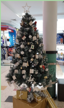
The "giving tree" at the Marketplace receives lots of generous visitors.

September brought plenty of blue heelers to town for the Great Cattle Dog Muster which was supported with special events at the art gallery and library and a great team of Pup Art! Dogs. Muswellbrook's beloved Big Blue Heeler took its place among nine other Aussie 'big things', to grace a new $1 collectable coin, as part of the Big Things collection. The coin is based on Muswellbrook's Blue Heeler statue and incorporates an image of Campbells Corner adding an additional layer of local significance.