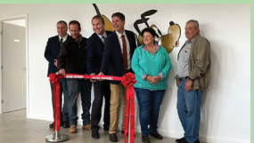
The new Sustainability Hub. All smiles at the opening of the Muswellbrook Animal Care and Sustainability Hub.

The Muswellbrook Animal Care and Sustainability Hub was opened by Member for Upper Hunter Dave Layzell. Council endorsed the development of a tailored model for the region to collectively grow and promote the visitor economy. Denman Memorial Hall rolled out the red carpet and upped the glamour for the awards night and celebration of the 10th anniversary of the Blue Heeler Film Festival.