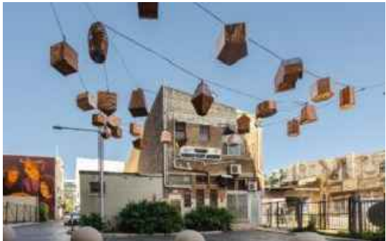
Catenary public art