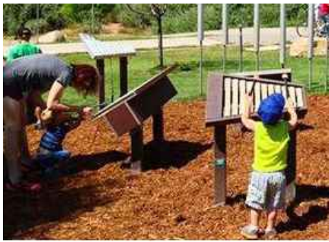
Musical garden with sound play