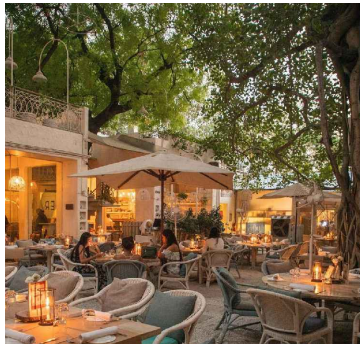
Outdoor seating area under umbrella