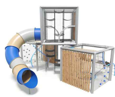
Possum theme sculptural play