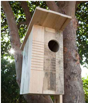
Possum nesting box fixed on tree