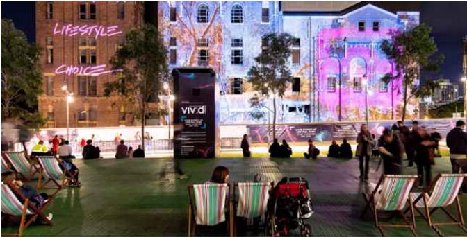
Art projection onto wall