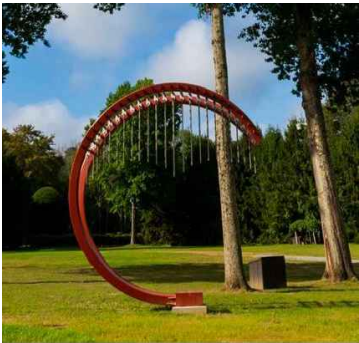
Sensory public art piece (chime)