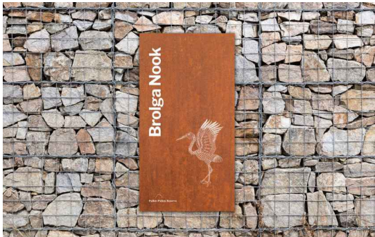
Park naming signage & feature wall