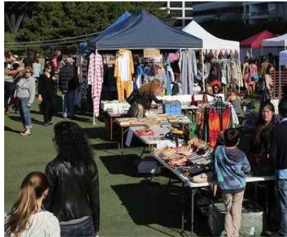
Weekend market stalls