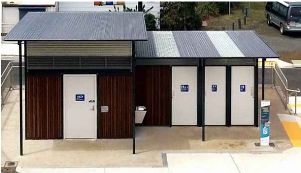
Modular (relocatable) changing places restrooms, PWD and unisex cubicles