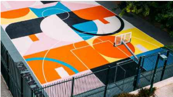
Fenced basketball court