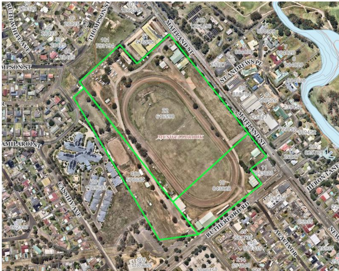
Figure 1 - Locality Map